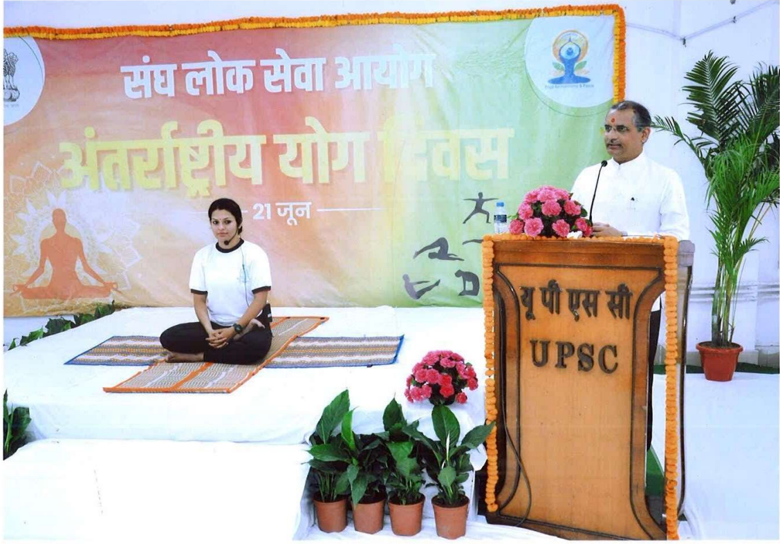
Dr. Manoj Soni, Hon'ble Chairman, UPSC addressing the staff of Commission on the occasion of International Yoga Day celebrated on 21st June, 2023.